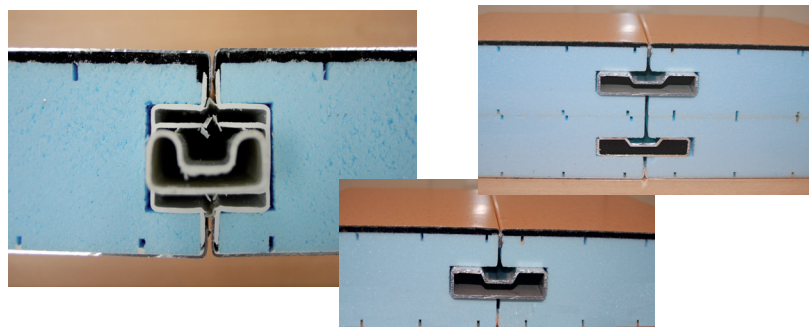
Self-supporting range: thickness of 55, 60, 66, 85, 105 mm References: AXA55+, XA55R16+, XA60R16+, XA66R16+, XA85R16+, XA105R16+