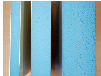
Filling range: thickness of 16, 32, 52, 82, 102, 164 mm References: X16, X32, X52, X82, X102, X164

AV Composites' panels, together with their junction systems are protected by numerous patents!